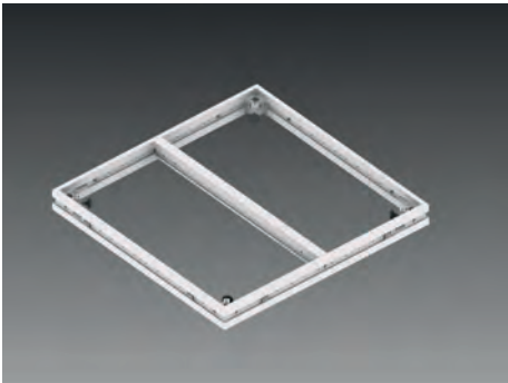
Stage Deck Frame

HOAC® Stage Decks are designed to build your staging area in the most flexible way. Column Heights go up to 5 m, deck sizes start from 1m x 1 m up to 1,5 x 1,5 m. 1000 mm telescopic range allow you to set up single decks or rows or areas in different heights. The systems allows to lift up frames at any stage area without dismantling the whole row or stage. Our new patented Link block backloaded gives you the freedom to open your stage wherever it is needed.