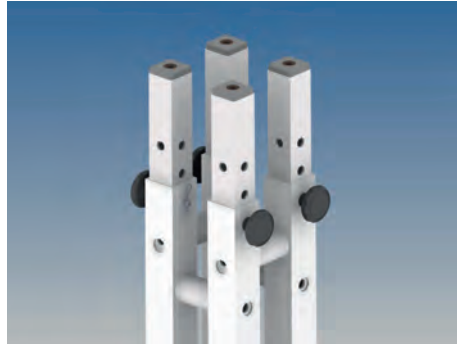
Stage Deck Column

The basic element of the modular system is offered in many different sizes. We use our unique and intelligent connection to lock the frames together with inner tension - without using tools.