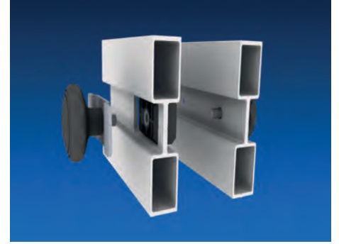
Link Block Preloaded

HOAC® Stage Deck Column is special designed to assure the stable and tight stage underconstruction up to 5m on one hand and to manage each frame as a single frame. The telescopic range goes up to 1m.